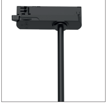
LP long mounting pipe 500 mm