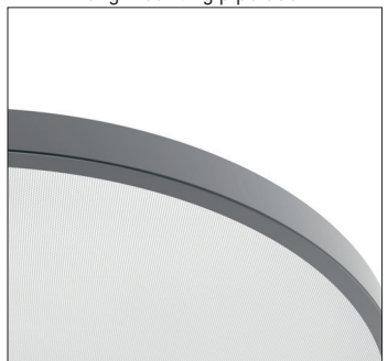
MP19H microprismatic diffusor